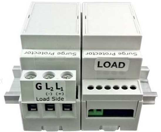
TK-LT250-30A-DIN2 TPD-24SLP4 for 4 wire or TPD-24SLP2 for 2 wire

Need additional assistance? Call Technical Support 1-888-281-7856 info@totalprotectiondesign.com www.TotalProtectionDesign.com