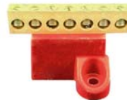
Model # TPD-GRD